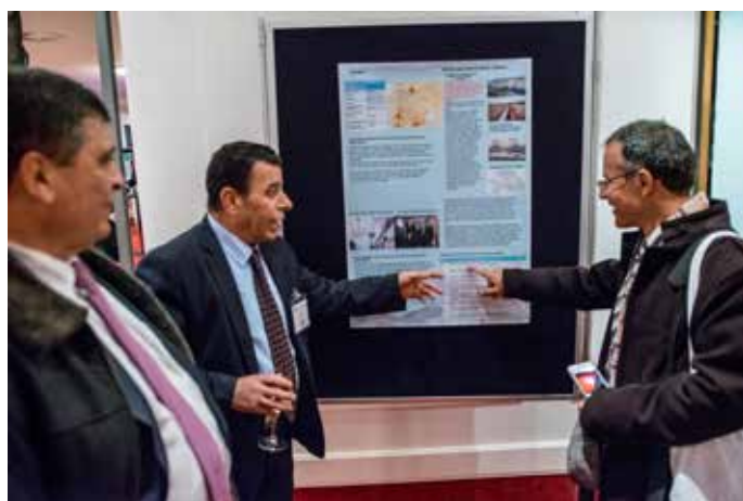
Discussing the country posters

All workshop broadcasts, including country interviews, available at: https://www.facebook.com/UnitedNationsWater/playlist/223059578233702