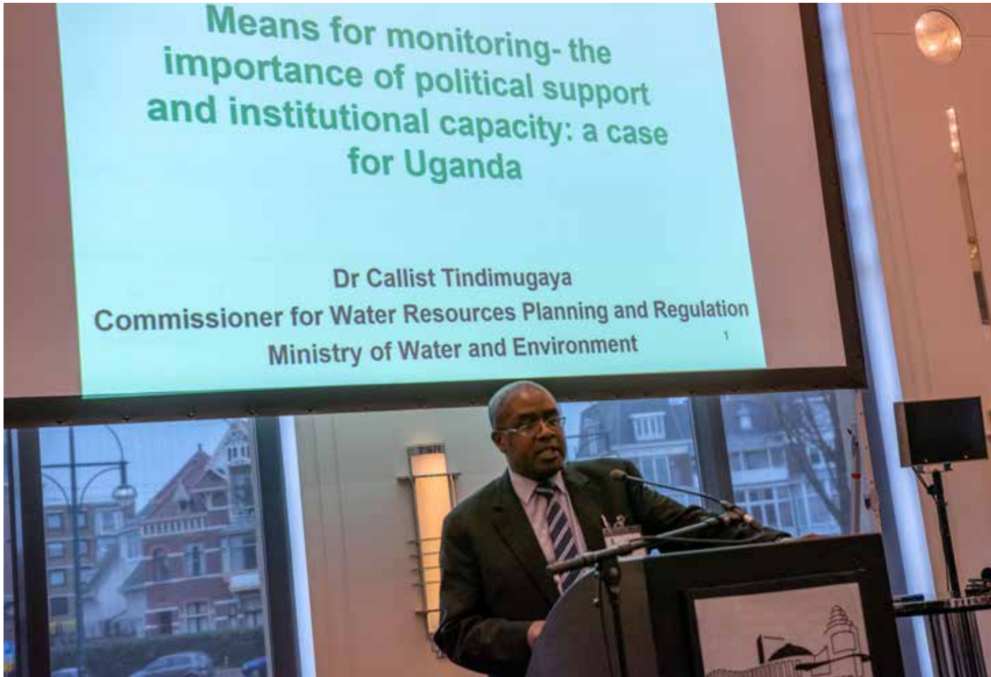
Uganda and Peru delivering their case studies