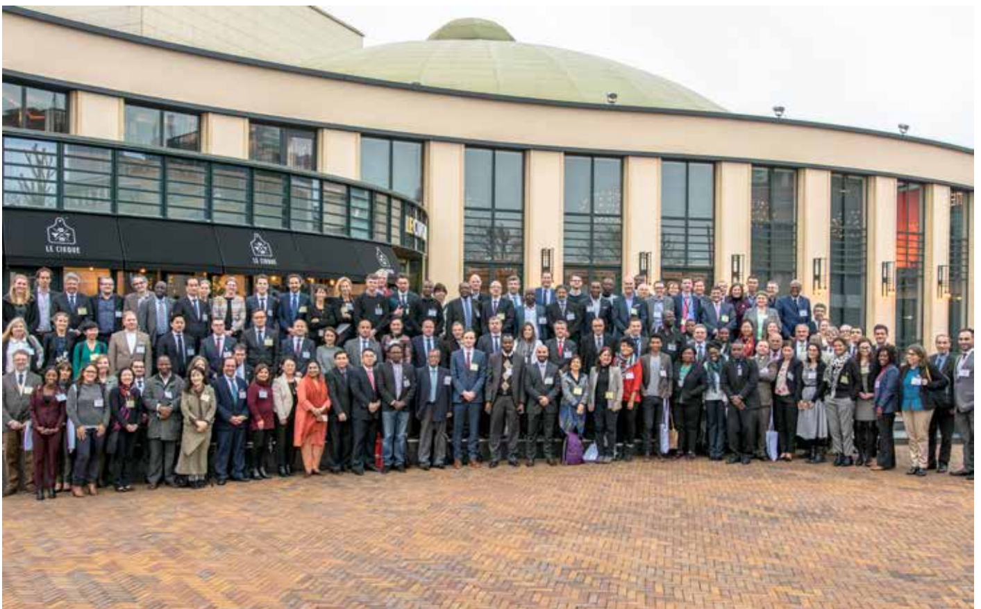
Group Photo - workshop participants