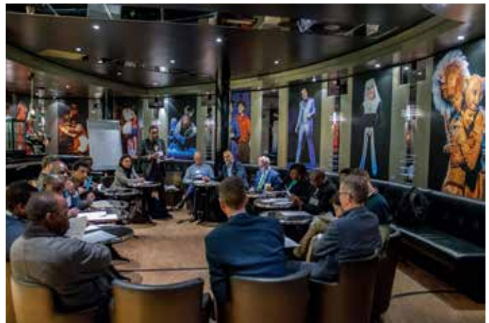
Market stall discussion

The session was closed by Mr Biancalani of FAO, who noted that the afternoon had illustrated the various results of the baseline process, with a good amount of data available on most of the SDG 6 indicators. He also noted the need for further involvement and reactions from countries, and for further efforts and coordination by custodian agencies. He thanked participants for their active and informed participation in the market stall discussions and highlighted that the next day's sessions would be more forward looking and inform the design of the next phase of SDG 6 monitoring.